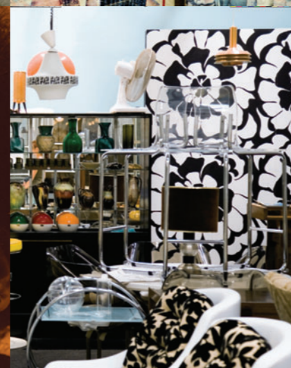
CLOCKWISE FROM LEFT: STREET STYLE- JOHANNESBURG; A TOWNSHIP SALON, THE HEART OF SA STREET STYLE; WALL PIN-UPS AT A HAIR SALON, YEOVILLE; A STORE OF VINTAGE COLLECTIBLES.

were different. "My dear friend and mentor (the company president) died of AIDS in April 2005," she remembers sadly. "I felt empty. The 'soul' of the experience for me was closely tied to my mentor. I felt an incredible pull to do something about AIDS, because it suddenly had a face for me." But at the same time, "I didn't want to walk away from the world of style."