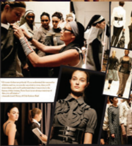
CLOCKWISE FROM LEFT: 'RAW BEAUTY'; A KWA MASHU TAILOR'S HOUSE; AT CAFE MZOLI IN GUGULETHU; SA FASHION WEEK, MARCH 2007.

But the book also travels past metropolitan/cosmopolitan arenas into 'real' and rural South Africa, in search of not only nature and culture, but style. Among the trickle-up/trickle-down trend cycles, which is more predominant? "It flows both ways, although it skews towards trickle-up," she answers. "The luxury/ high-end space there... draws on history and cultural renaissance for inspiration."