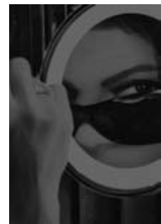
OBAMA SPREAD

Consider this a gift from the Purple One to you. The thick tome, which owes its name to Prince's 21 nights at London's O2 arena in 2007, offers an intimate look—from the stage to the hotel—into nearly one month in the life of the icon, as seen through the lens of Randee St. Nicholas. Original poetry, lyrics to new music, and a CD of post-show jam sessions are included. □