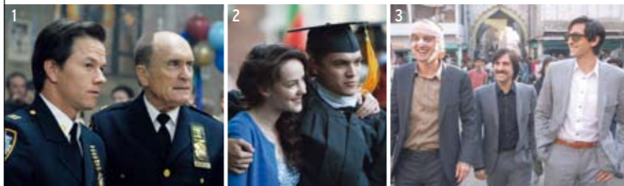
1 Mark Wahlberg and Robert Duvall in We Own the Night . 2 Into the Wild . 3 The Darjeeling Limited .